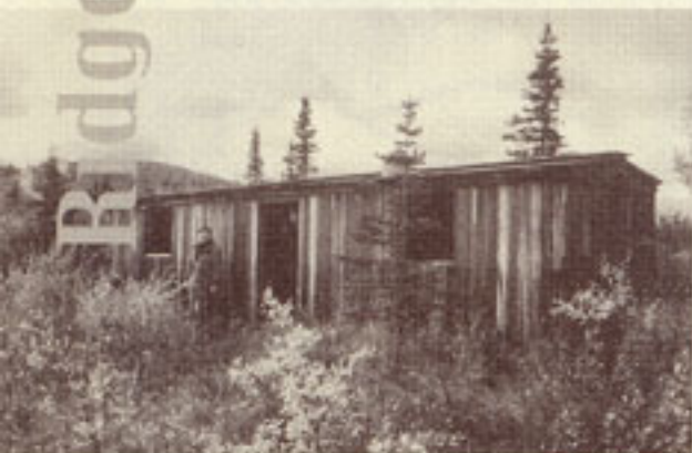
Boxcar at Soda Station

Roadhouses, stores and freighting companies operated successfully along the route despite spring glaciers and a steep descent to the placer mines. Gold miners along Bonanza Creek ridiculed Commissioner William Ogilvie for supporting the project and lobbied for a more convenient route. After good roads were completed up Bonanza and Hunker creeks, the Ridge Road was abandoned in 1902.