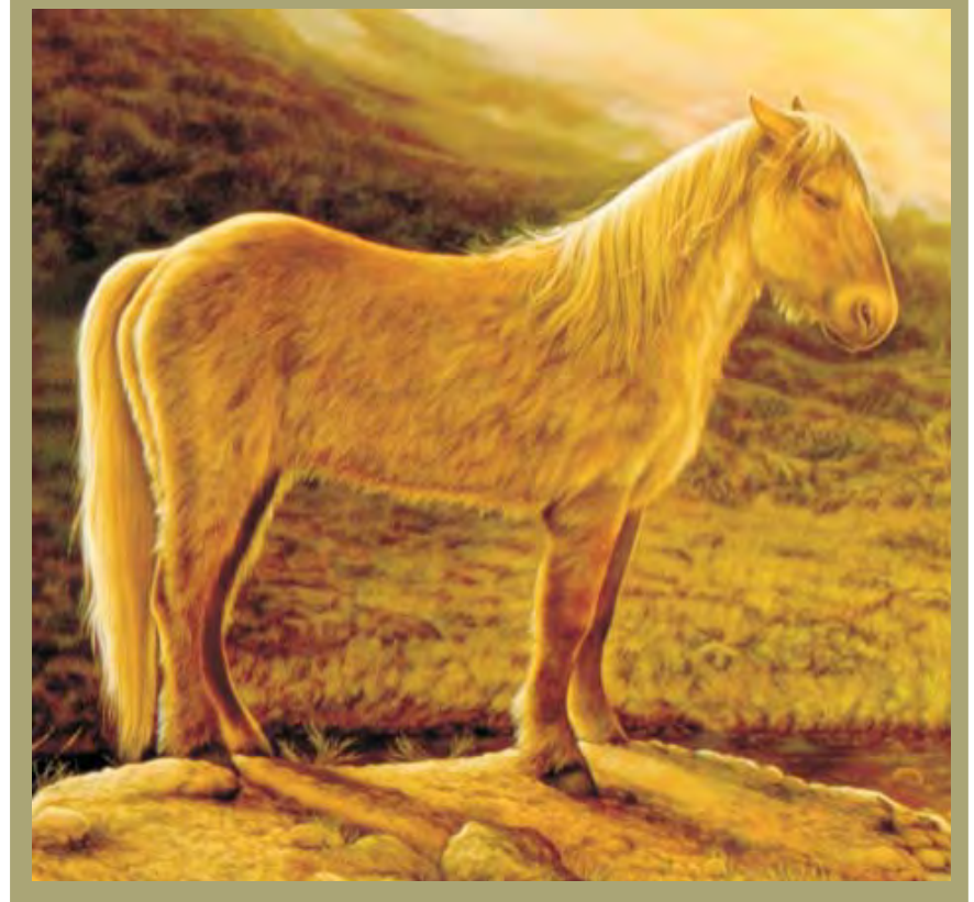
Figure 1: Yukon Horse ( Equus lambei ). Detail of a painting by George Teichmann.